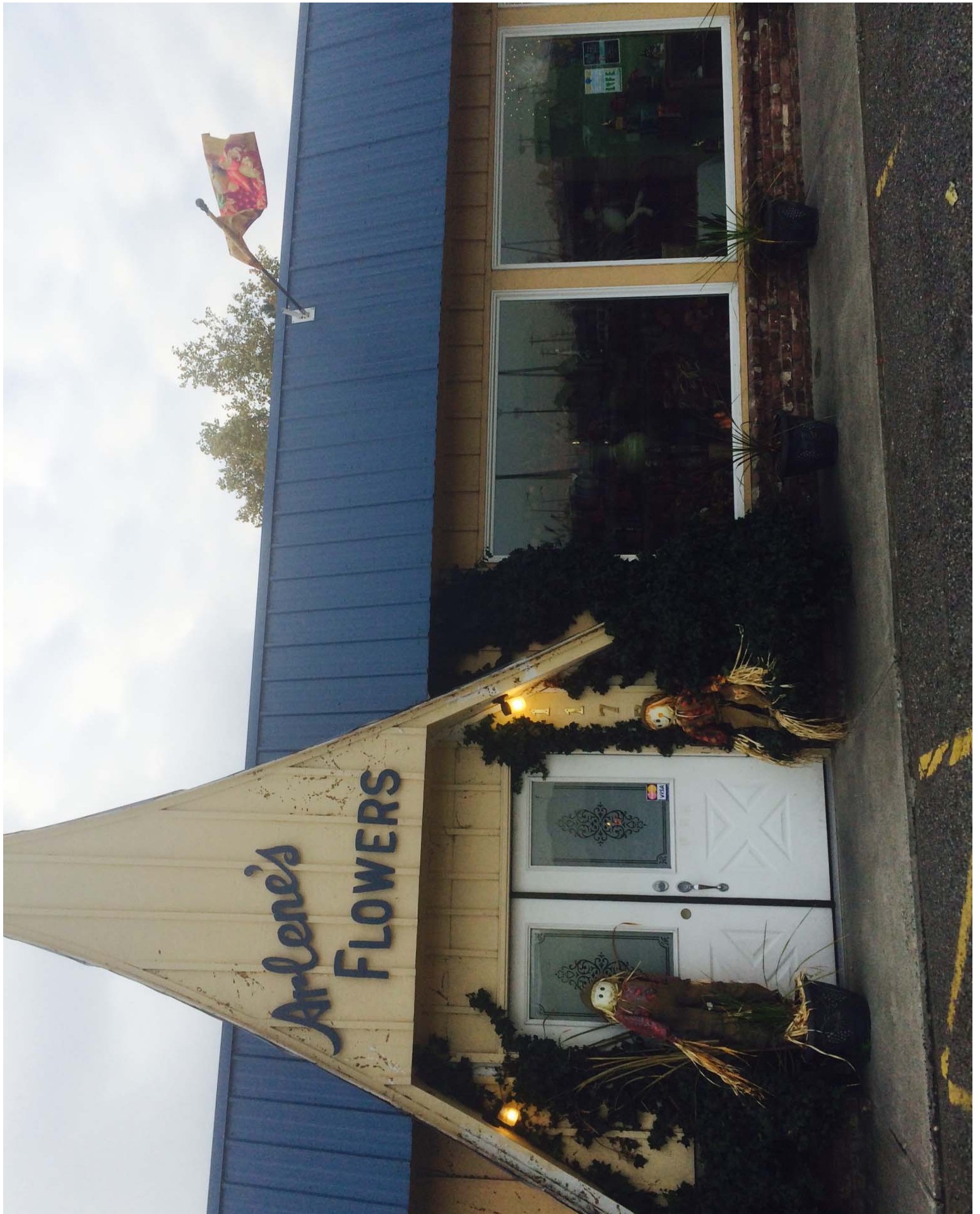
Stutzman Decl. Exhibit 2 - 001