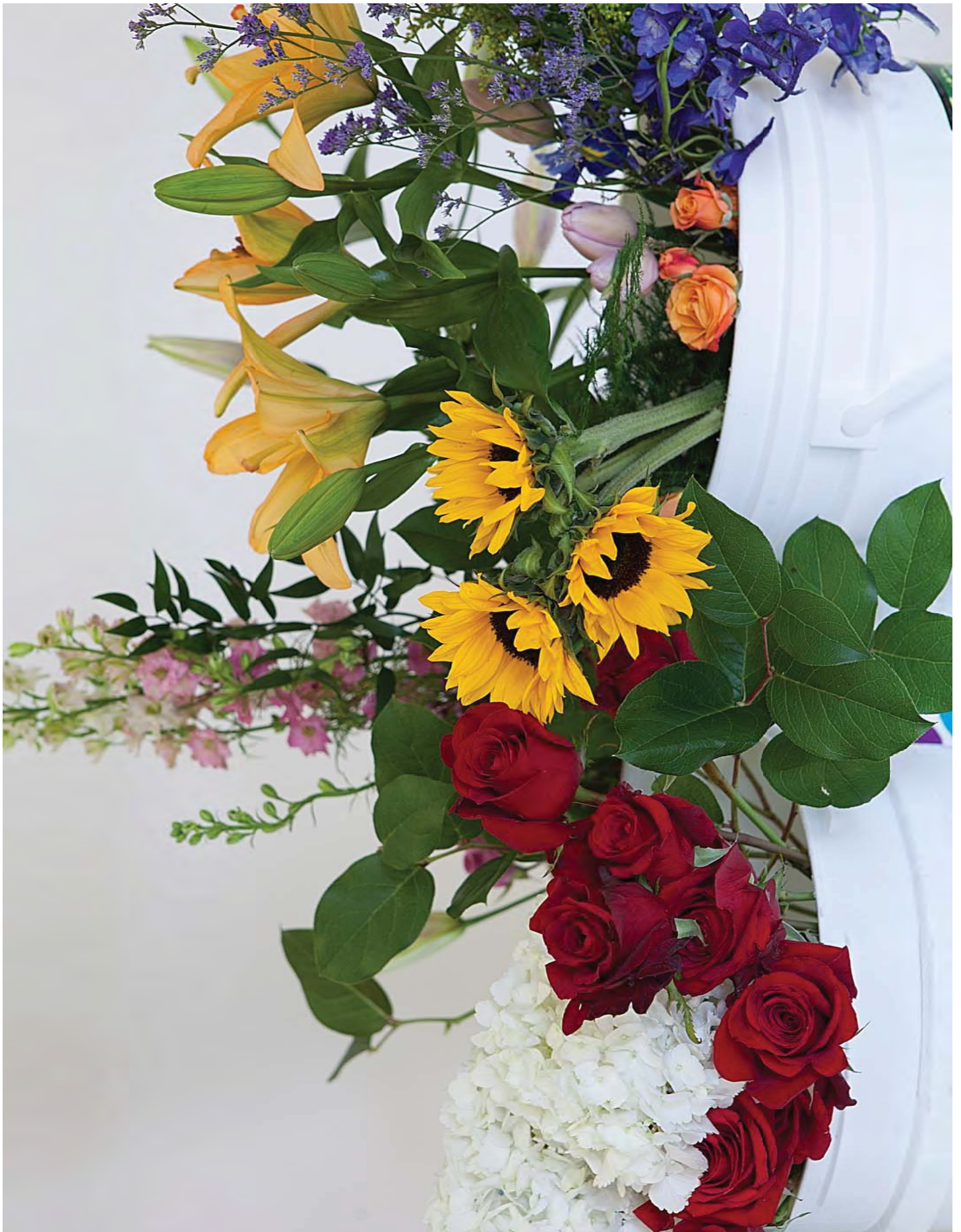
Stutzman Decl. Exhibit 1 - 001