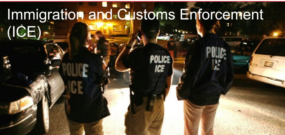
Immigration and Customs Enforcement (ICE)