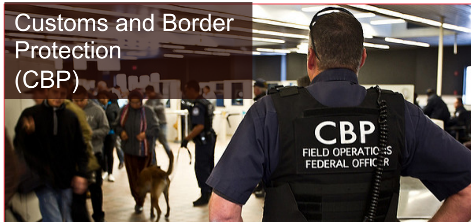
Customs and Border Protection (CBP)